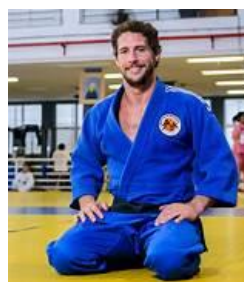
Flávio Canto 2023