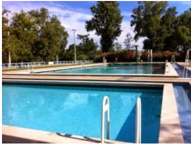
Free Swimming Pool