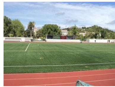
Athletics / Football